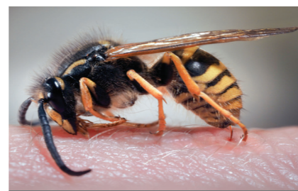
The sting of a wasp on a human hand. Note the swelling and redness.

If after a sting you have difficulties breathing, dizziness or a swollen face - you need to seek immediate medical treatment. If you've not had a severe allergic reaction, your sting will still be very painful. To treat a sting yourself: