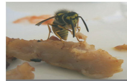
Wasps in your premise can be more than a nuisance.

You have a duty to protect your customers and staff. To minimise the disruption to your business, we suggest you contact a professional pest controller.