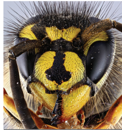
Wasps make up an enormously diverse array of insects, with some 30,000 identified species.

Pest controllers get thousands of call-outs to treat for wasps every year - so if you're having wasp issues, you're not alone! Whether you're thinking about doing some DIY wasp pest control, or you're looking to enlist the help of a professional pest management company , this guide's for you.